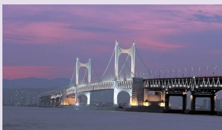
Kwang an Bridge, Busan

October 27-30 2009, Busan, Korea Charting Progress, Building Visions, Improving Life